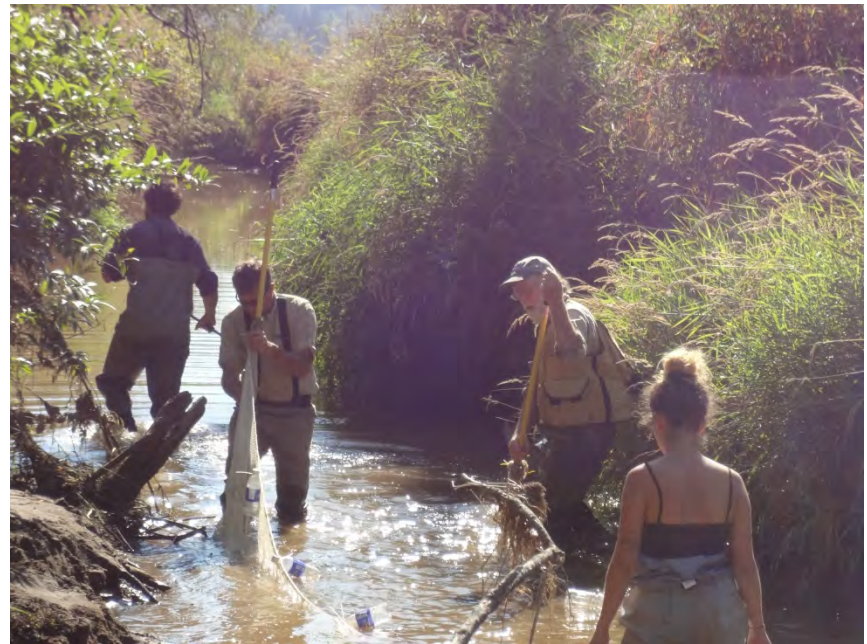
Ohop Creek, Pierce Co.