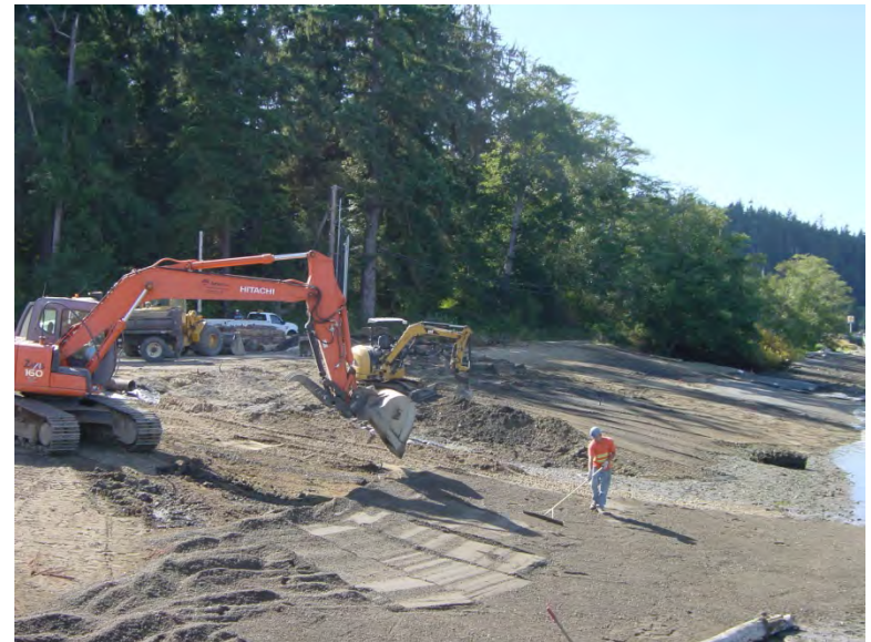
Cornet Bay, Island Co.