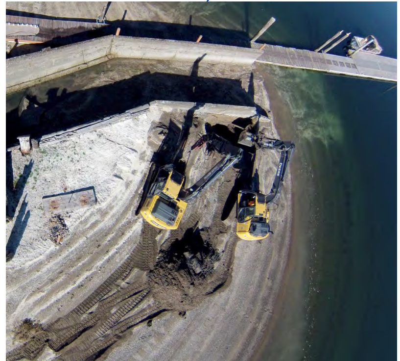
Arcadia Point, Mason Co