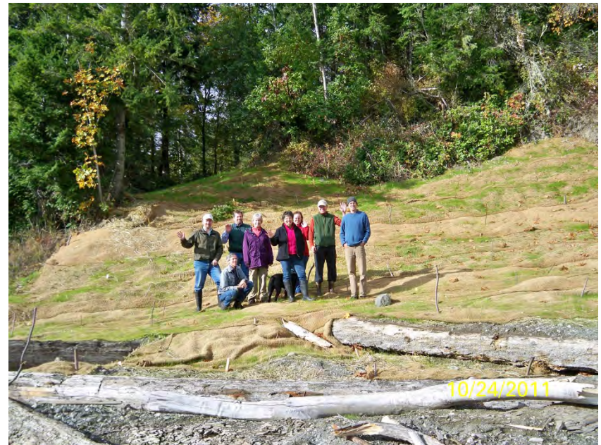
Tarboo Bay, Jefferson Co.