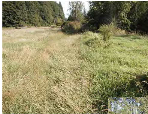
Kendal Creek Whatcom Co.