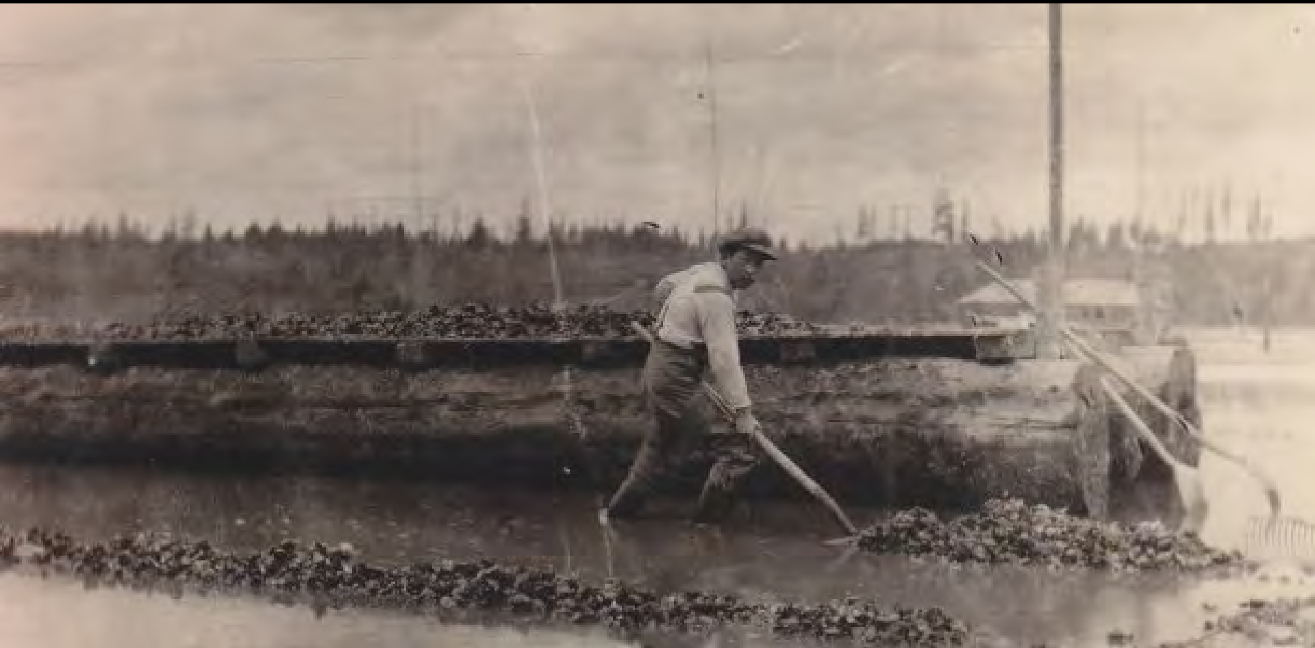
J.J. Brenner Oyster Co., Oyster Industry Scrapbooks, vol. 1.

🎵 To the tune of the Tennessee Stud by Jimmy Driftwood 🎵