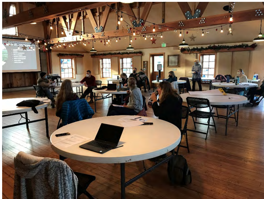
MRC members and County Environmental Stewardship Staff meeting in person for the MRC's annual retreat in December 2021.