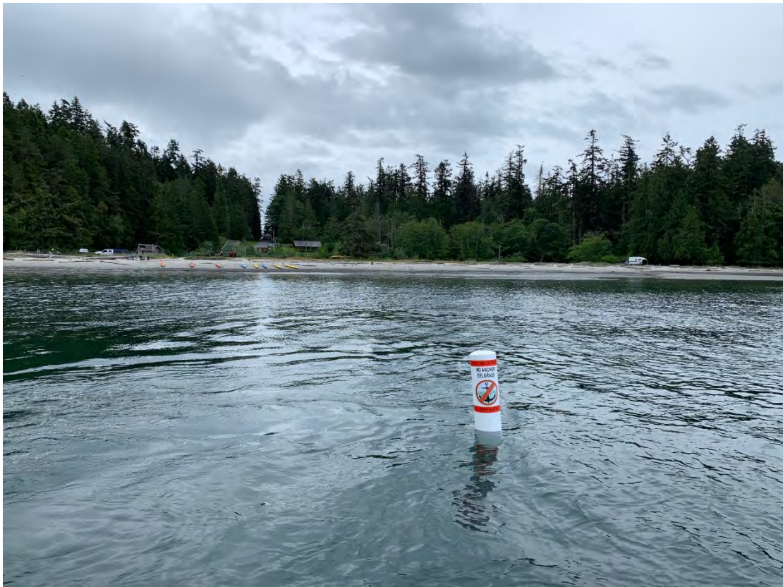
Anchor Out Zone installed at Odlin County Park.