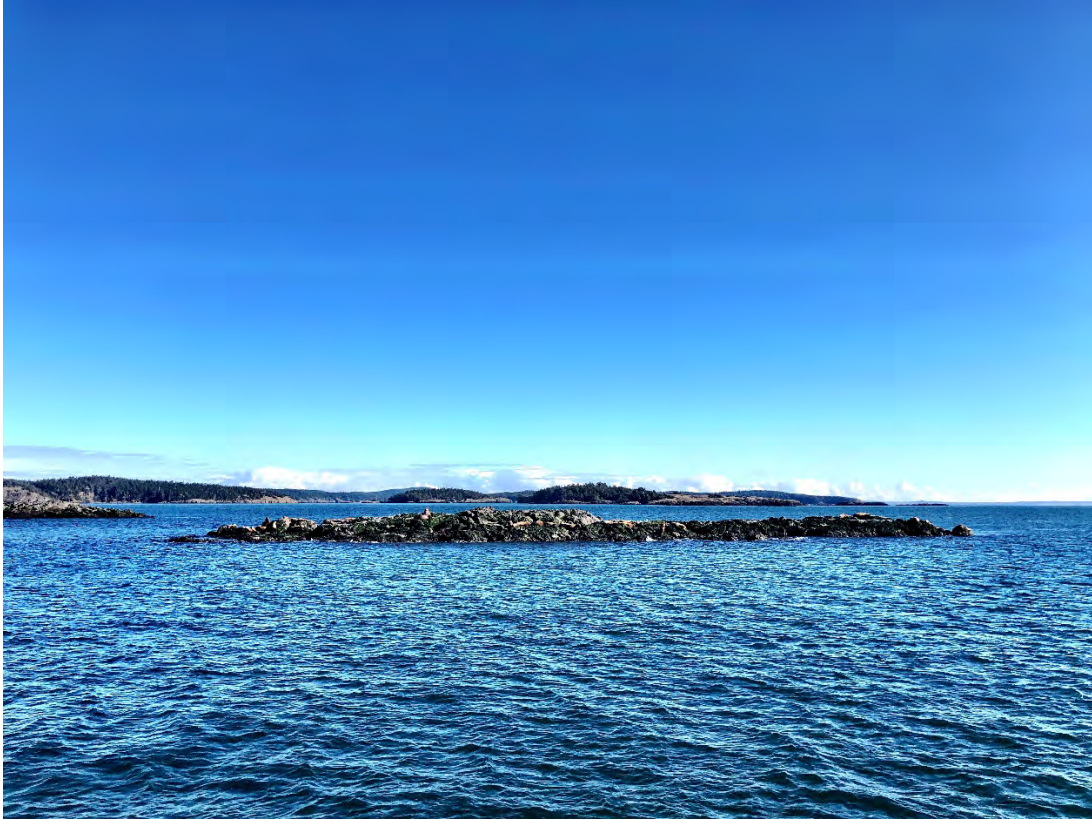
Sea lions hauled out at Whale Rocks, San Juan Channel.