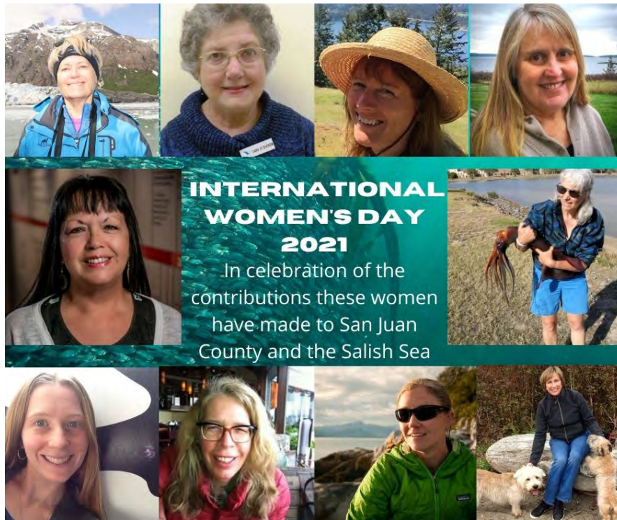
Celebrating all the outstanding women on the San Juan County MRC.