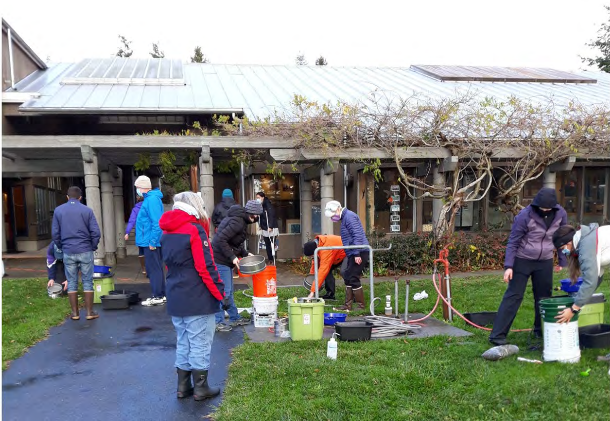
Island MRC volunteers attending the Forage Fish training hosted by WA DFW.

Photos (photos of recent projects or members—include project, photo credit and additional info):