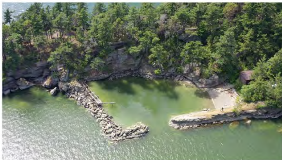
Clark's Point Before

We will continue to watch the site as it changes over the next few years, looking at the small patches of eelgrass that provide refuge and foraging for salmonids as well as crabs, shrimp, marine birds and other critters.