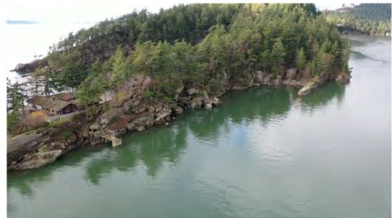
Clark's Point After