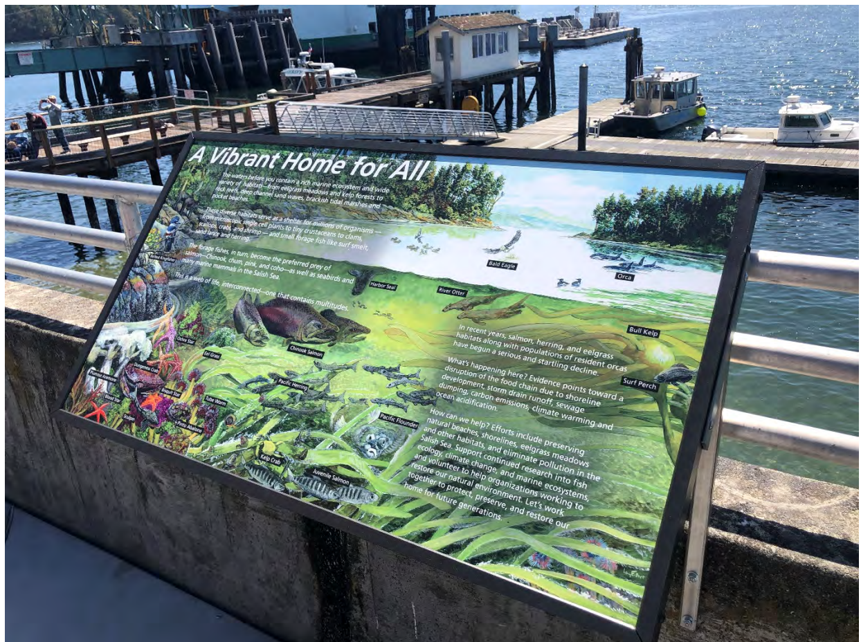
Signage created by the MRC for the Orcas Landing Marine Interpretive Area finally installed. May 2021.

No photos from this month but here is a selection from 2021.