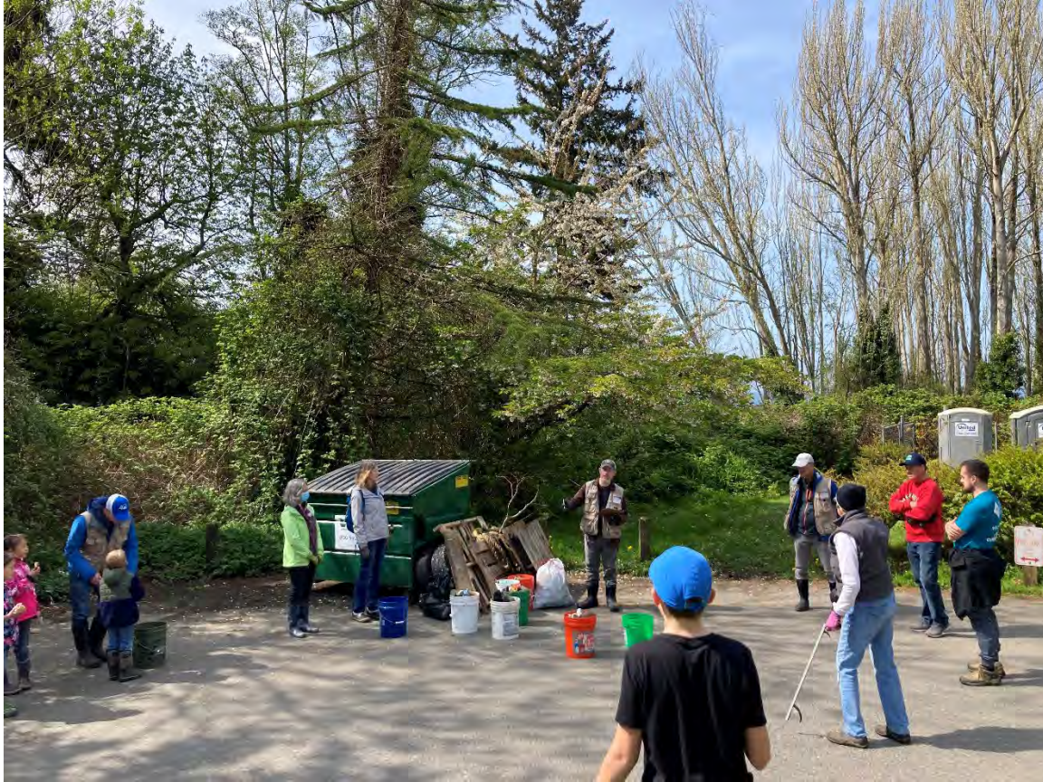
Photo 2: In partnership with WSU Beach Watchers and volunteers from Puget Sound Energy, the MRC cleaned up over 370 pounds of trash from the beach at Picnic Point on April 23.