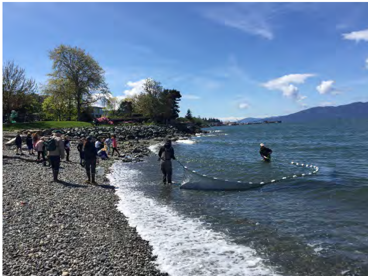
Seine with Silver Beach elementary.