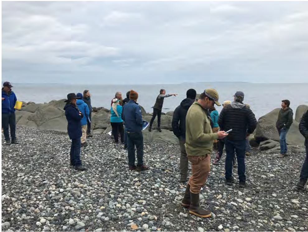
MRC members, TAG members and State review board members join project proponents at a site on Orcas Island.

Photos (photos of recent projects or members—include project, photo credit and additional info):