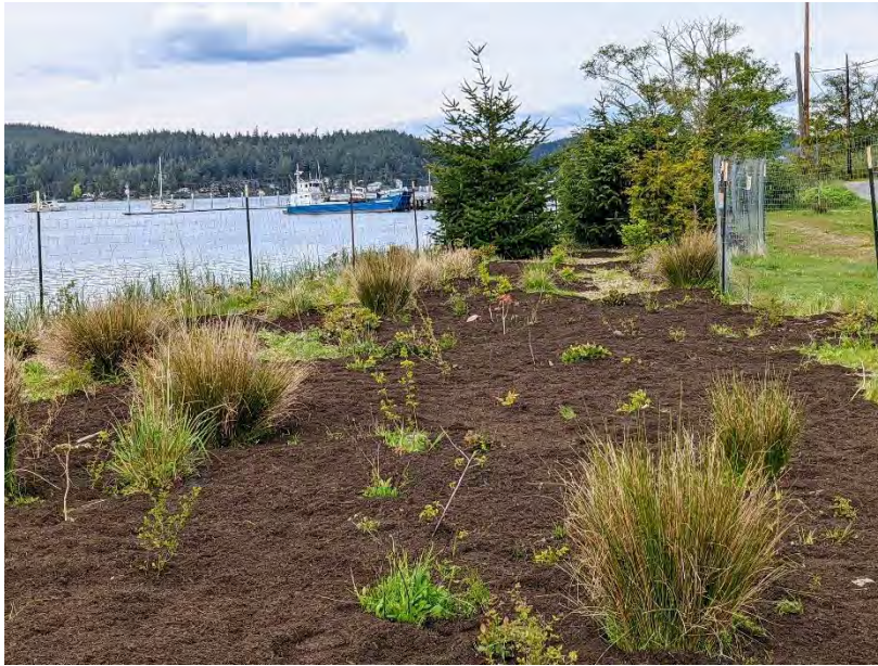
After Weeding and Composting at Cornet Bay Restoration