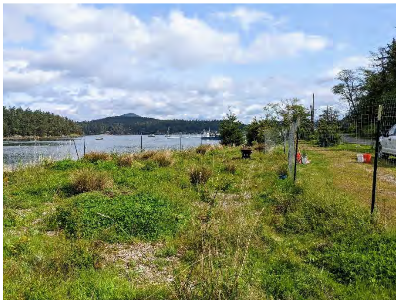
Before Weeding and Composting at Cornet Bay Restoration

Photos (photos of recent projects or members—include project, photo credit and additional info):