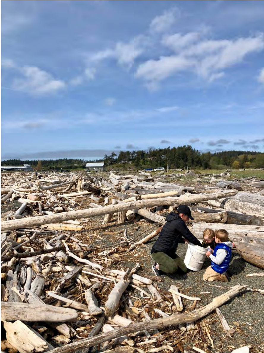
Rowan and friends helping to clean up Jackson Beach during this year's spring Great Islands' Clean Up.