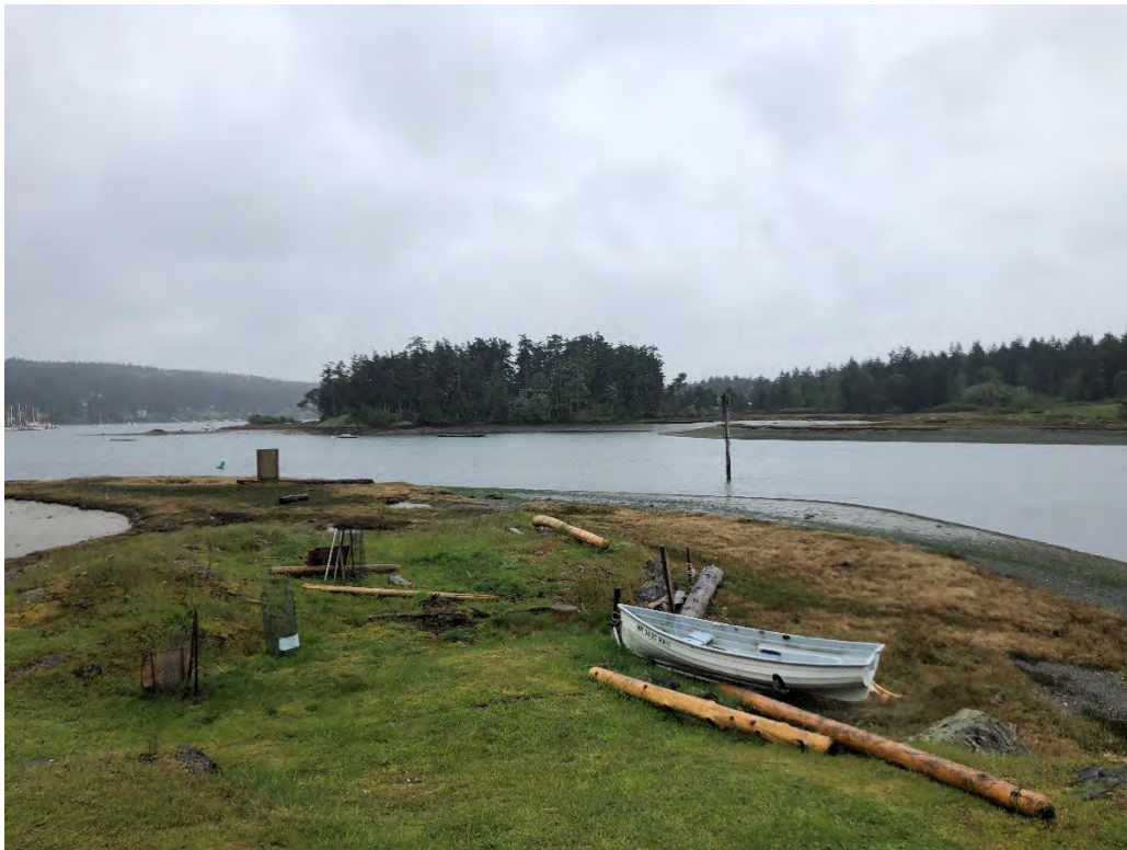
MRC members, TAG members and State review board members join project proponents at a proposed restoration site on Lopez Island.