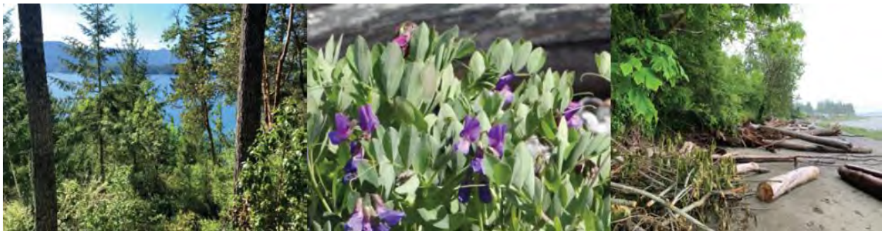
A variety of nearshore scenes