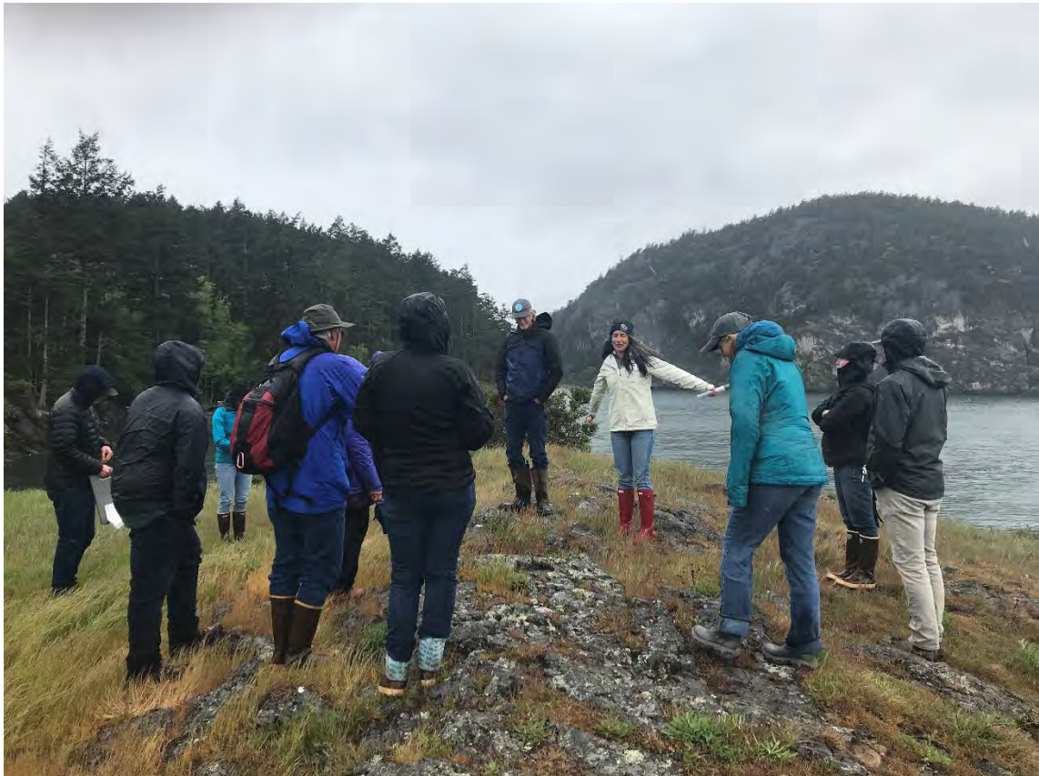
MRC members, TAG members and State review board members join project proponents and braved the rain at a site near Watmough Bay on Lopez Island.