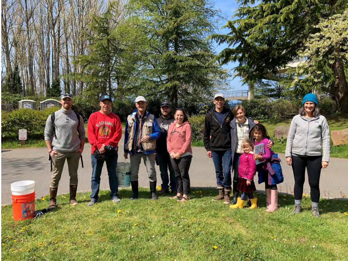
Photo 1: MRC Staff, Members, and their families at the Earth Day Beach Cleanup at Picnic Point on April 23.