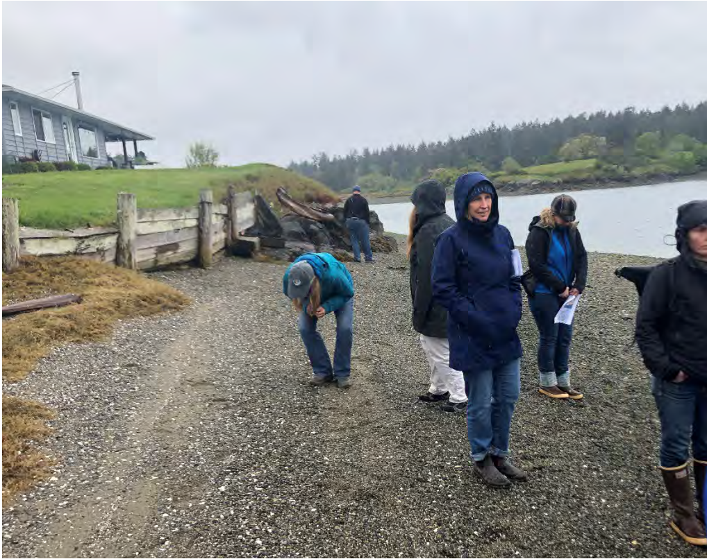
MRC members, TAG members and State review board members join project proponents at a proposed restoration site on Lopez Island.