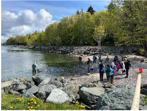
Seine with Northern Height Elementary.