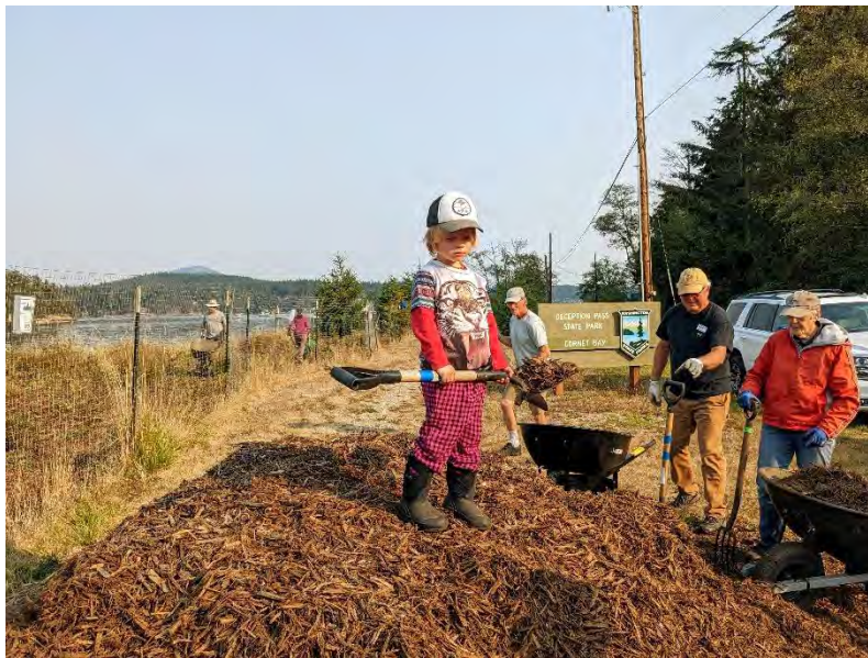
Orca Recovery Day at Cornet Bay

Photos (photos of recent projects or members—include project, photo credit and additional info):