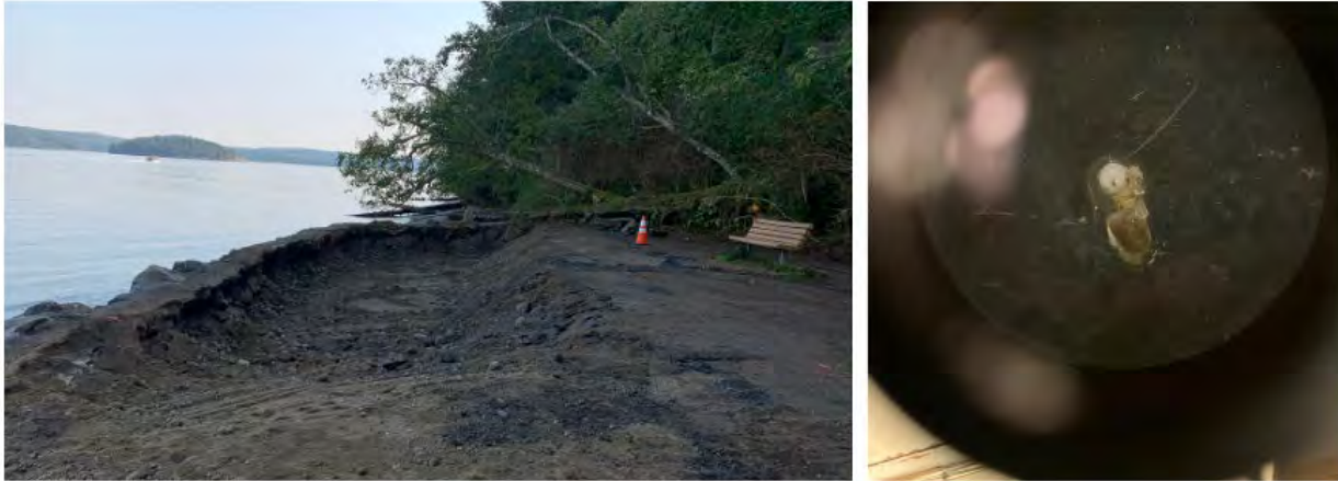
Construction progress at Hoypus Point (L) surf smelt egg found at Hoypus Point (R)

Restoration started, and then stopped at Hoypus Point when required forage fish surveys discovered eggs on the beach. PNW Civil completed as much of the upland work as they could to keep the project moving along including getting a start on excavating some of the fill, but a second survey ten days later resulted in more eggs. An overarching goal of this project is to improve the habitat utilized by these fish, so we are excited to know they are already there. Once construction resumes, their habitat will be even more suitable with 350 linear feet of armor removed and a riparian zone re-established with native trees, shrubs, and dunegrass.