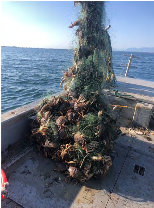
A portion of the net removed filled with Dungeness crab

Remember to do your part by reporting lost nets at derelictgear.org or 360-733-1725. We are here to help and get these nets out of the water before considerable harm is done.