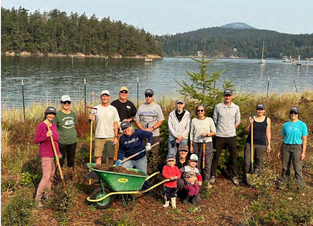
Volunteers at Cornet Bay worked hard on Orca Recovery Day to spread mulch