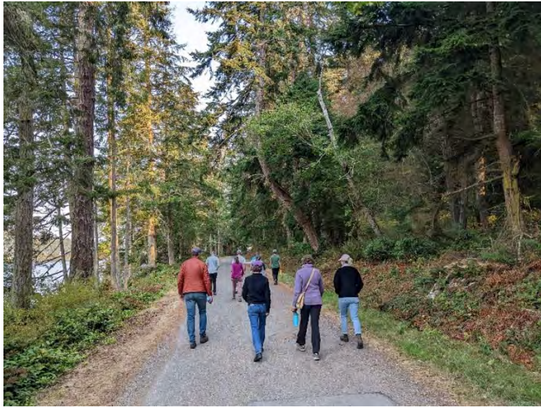
Orca Recovery Day – Guided walk