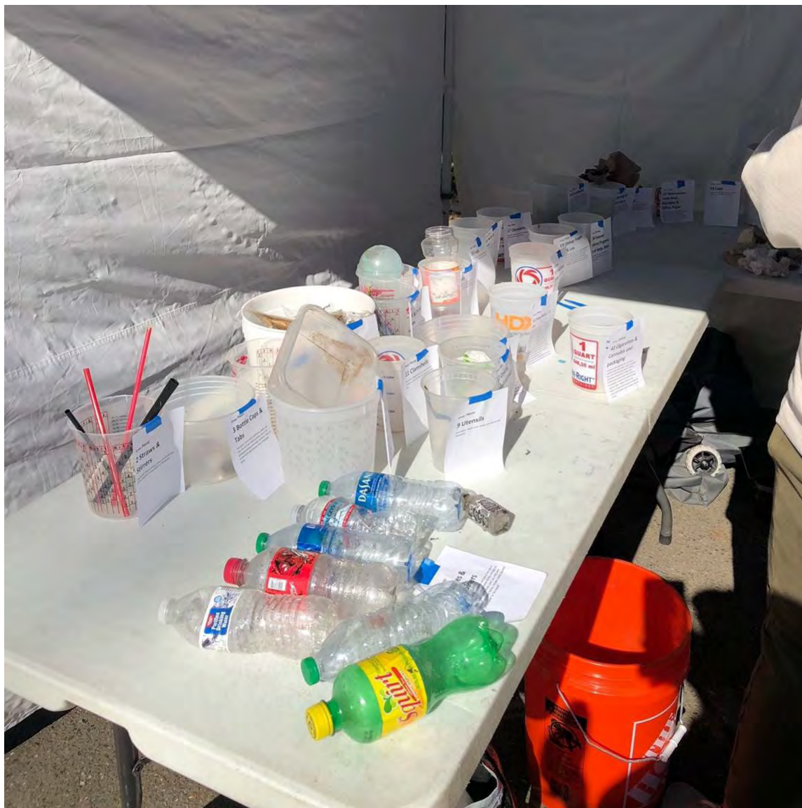
Photo: Trash sorting using EPA Protocol.