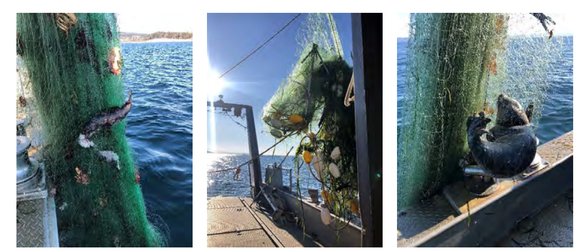
Net Removed near Port Madison, WA

Our newly lost net Reporting, Response, and Retrieval program removed three derelict gillnets, two of which were in Bellingham Bay and one in Port Madison. Found entangled in the nets were 9 seabirds, 2 harbor seals, 109 fish including chum salmon, lingcod, and rockfish, and 304 invertebrates mostly consisting of Dungeness crab and red rock crab. It is imperative that newly lost nets are reported immediately so we can locate them and initiate removal efforts before weather conditions cause them