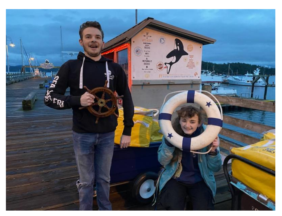
PFSS Contest Winner Announcements