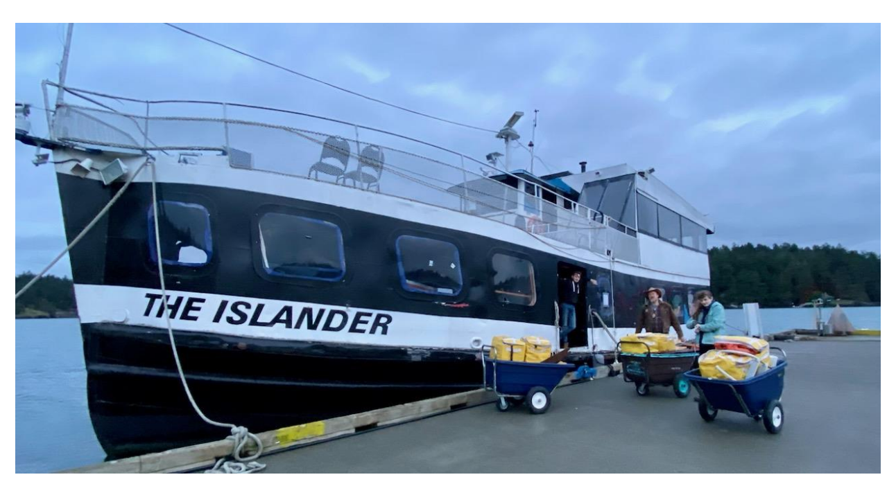
Sea Scouts on a pdf salvage mission! Rescuing usable gear and safety equipment.

Photos (photos of recent projects or members—include project, photo credit and additional info):