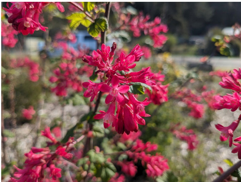
Cornet Bay – Red Flowering Current

Photos (photos of recent projects or members—include project, photo credit and additional info):