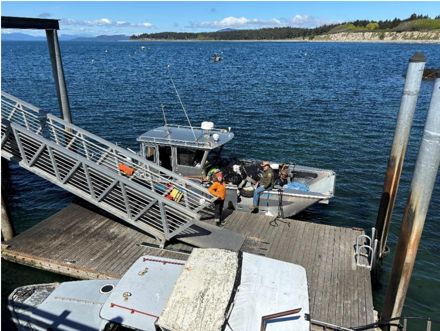
Outer Islands Cleanup.