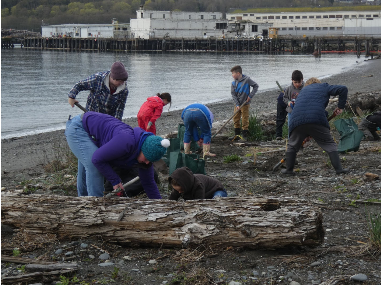
A crew of volunteers plants the restoration area on Ediz Hook 3/28.