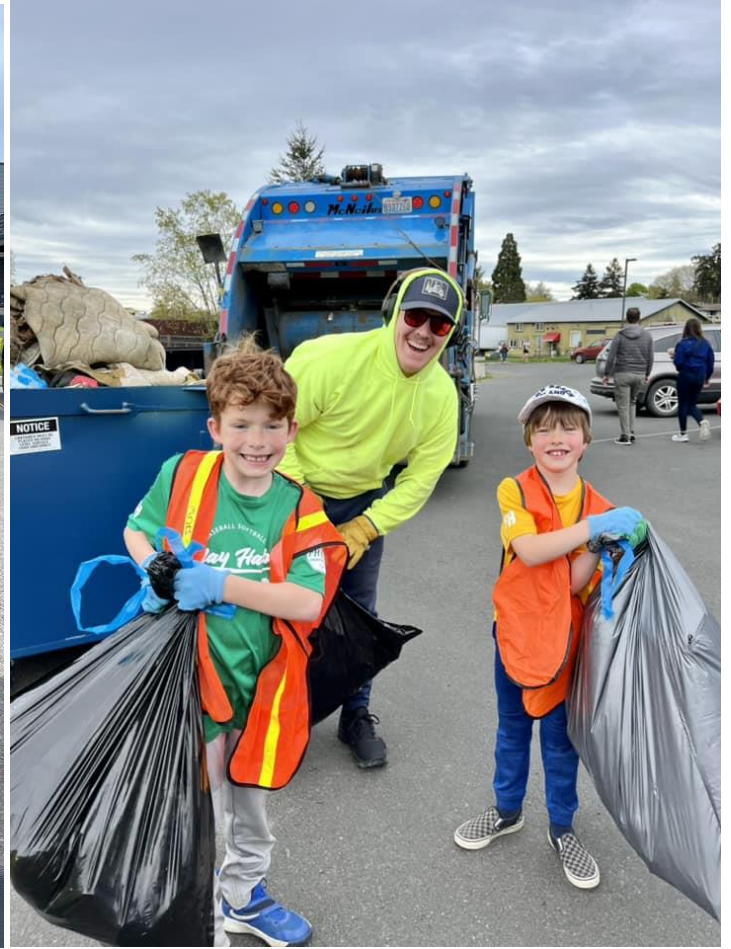
Great Islands Cleanup!