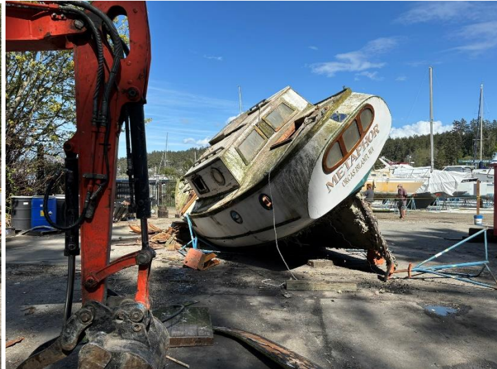
Vessels to be dismantled.