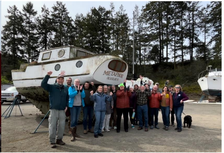
San Juan MRC field trip to the deconstruction.