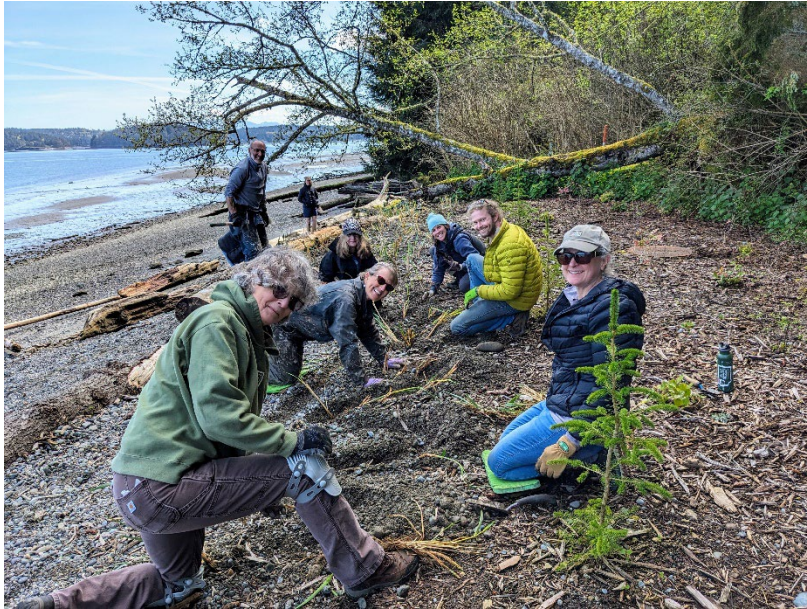
Hoypus Point – Dune grass planting