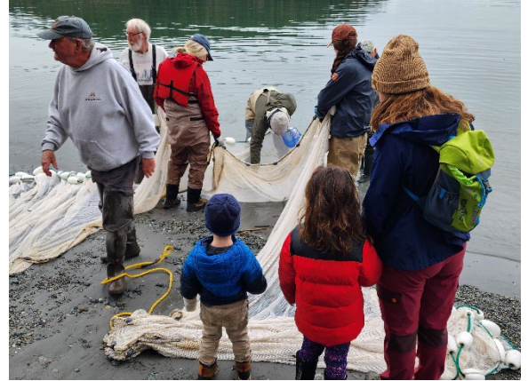
Bowman Bay Beach Seining