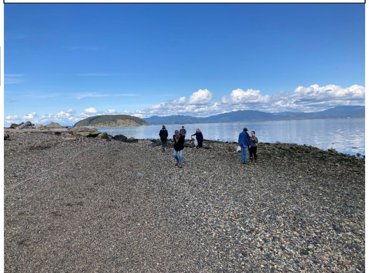
Salish Sea Stewards Training - Marchs Point