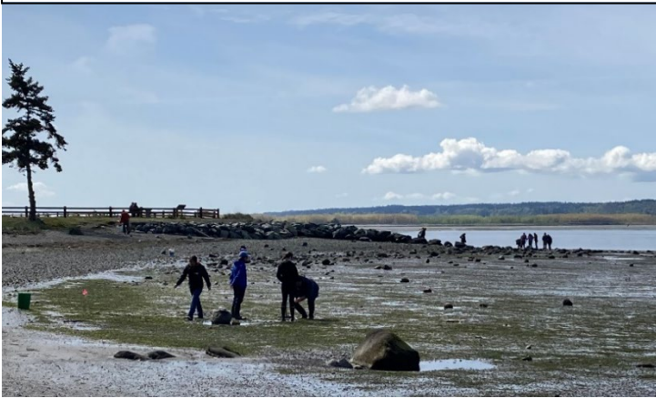
Kids on the Beach- Concrete High School at Padilla Bay- April 10