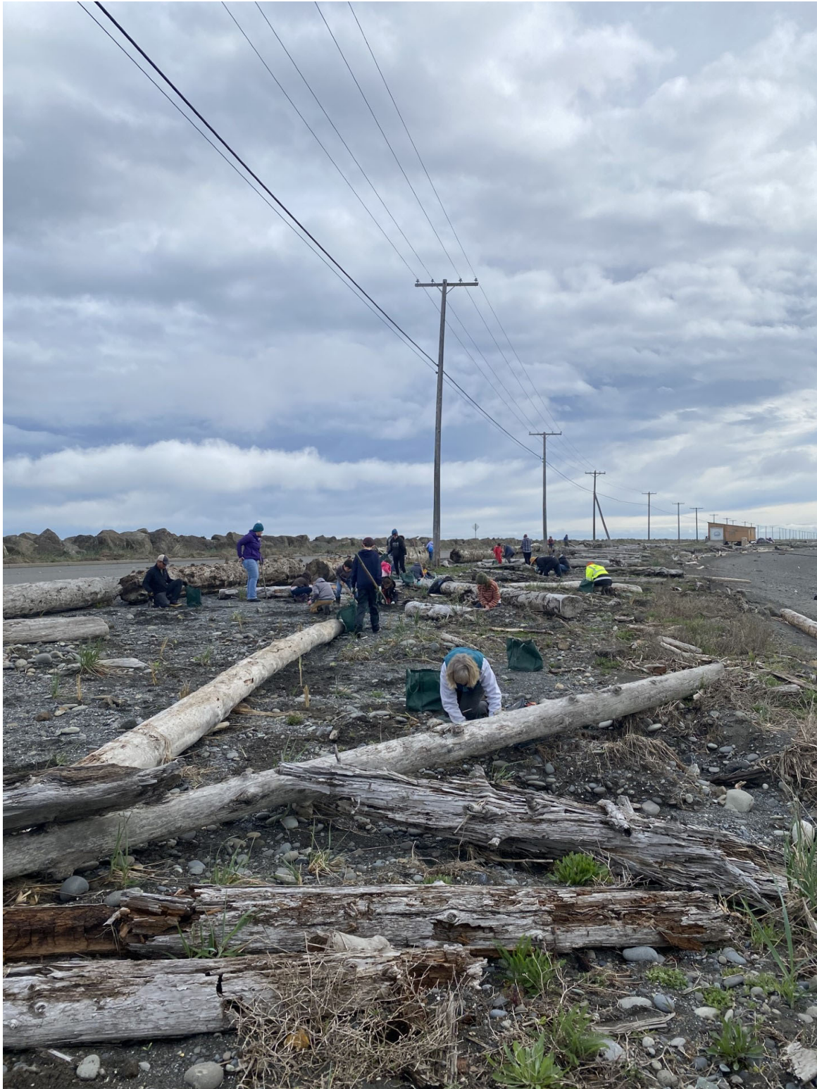
A crew of volunteers plants the restoration area on Ediz Hook 3/28, with MRC project lead Helle Andersen in the foreground with white sleeves.