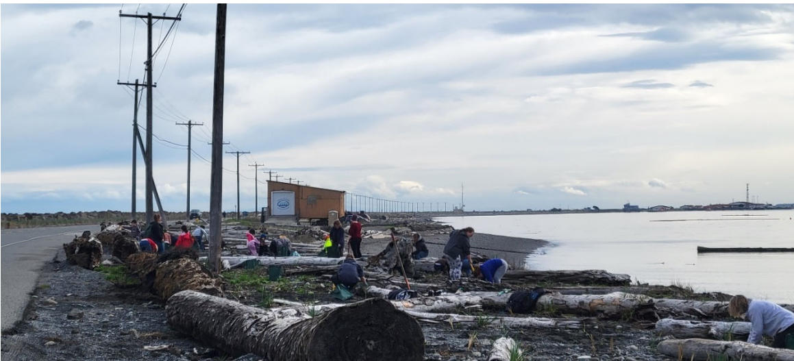
A crew of volunteers plants the restoration area on Ediz Hook 3/28.

Photos (photos of recent projects or members—include project, photo credit and additional info):