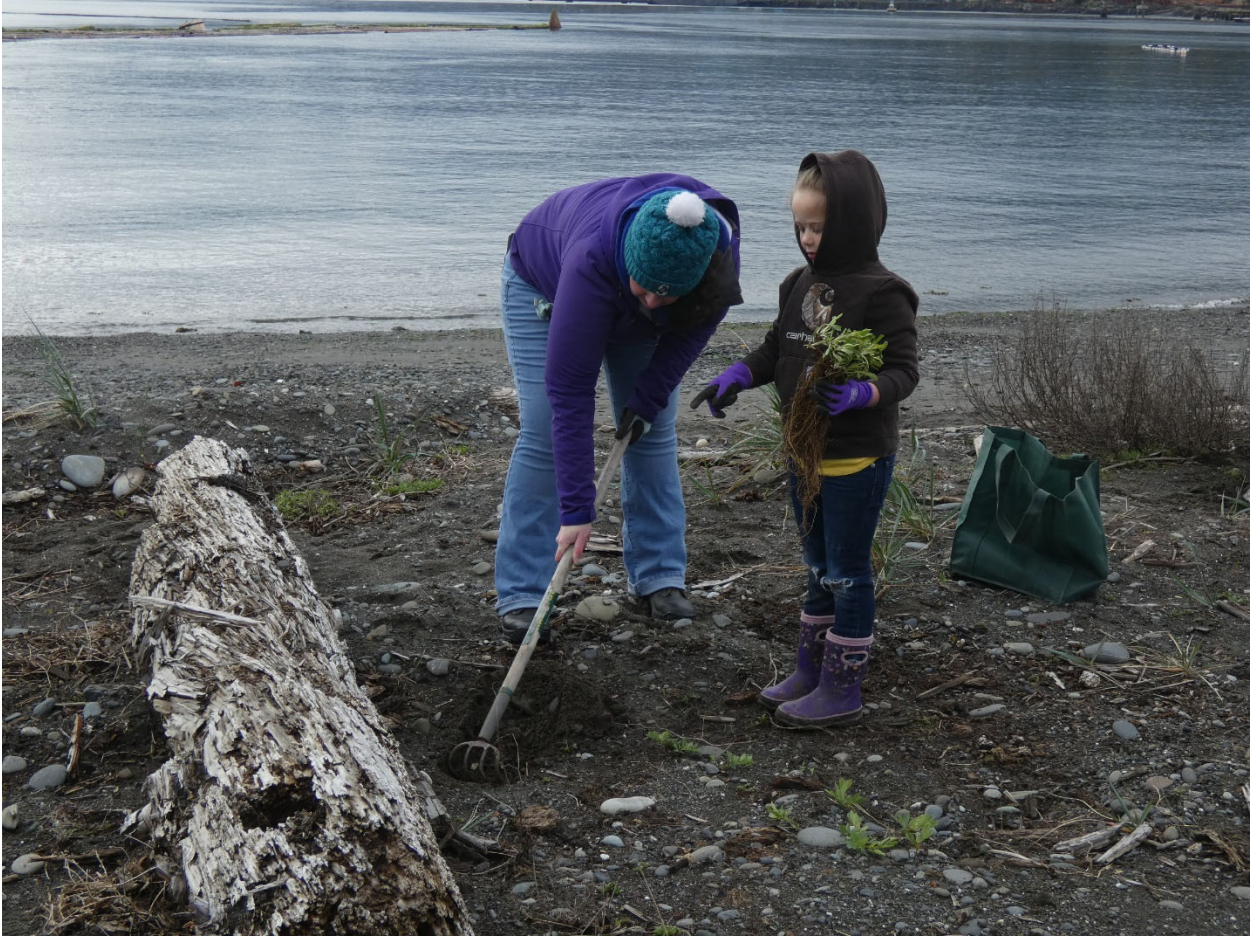
A young volunteer and her adult assistant plant the restoration area on Ediz Hook 3/28.