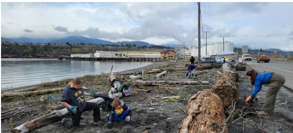
A crew of volunteers plants the restoration area on Ediz Hook 3/28, with Lower Elwha Klallam Tribe staff / MRC member Allyce Miller at right in blue.