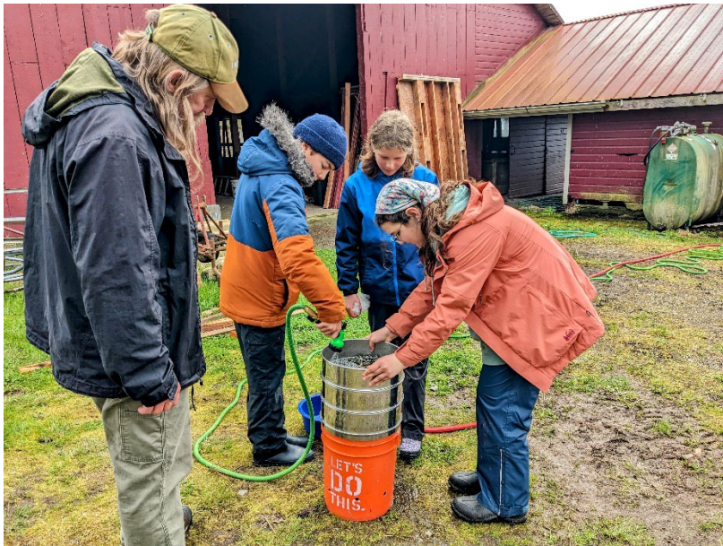
Keystone Farm – Forage fish field day