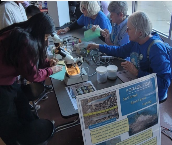
Mount Vernon High School Science Night- April 18 th . Forage Fish Outreach.