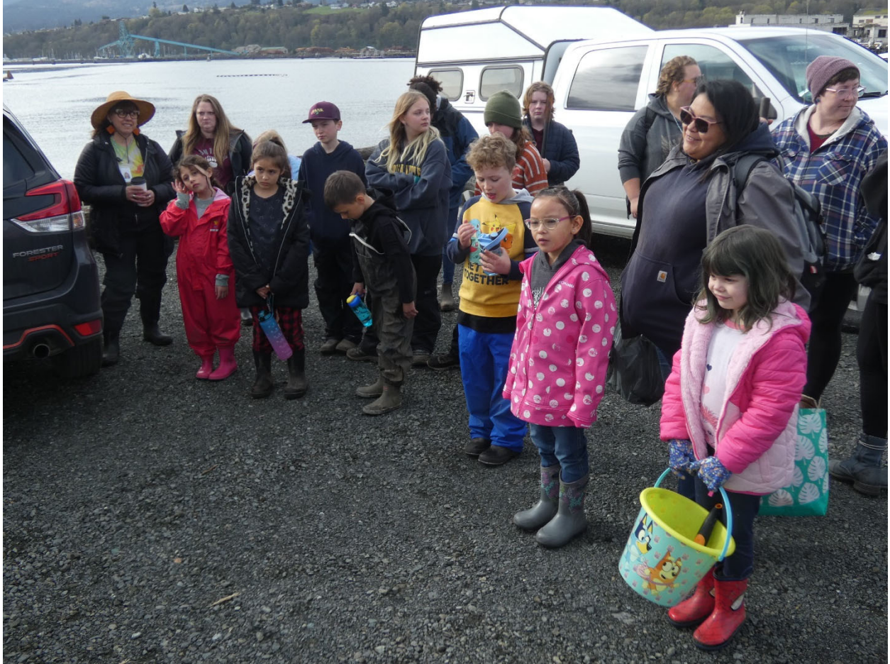
A group of students from the Pacific Northwest Discovery Academy, with chaperones and other volunteers, listen to an introduction to plants and planting techniques for the 3/28 planting event.