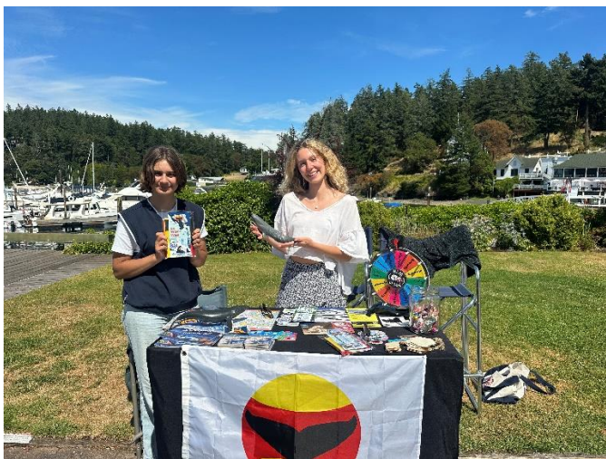
Dock talks at Roche Harbor.

Photos (photos of recent projects or members—include project, photos and additional info):