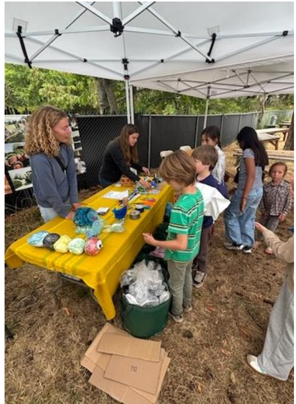
Plastic Free Salish Sea's Litter Critter Lab – participants used recycled materials to craft unique critters.