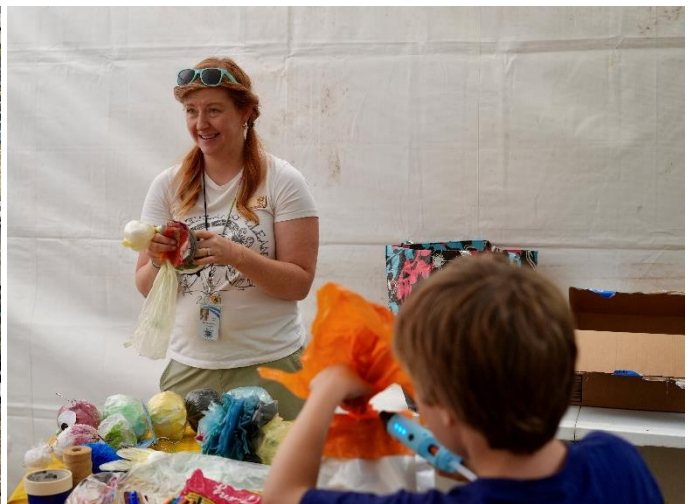
Plastic Free Salish Sea's Litter Critter Lab at the County Fair was a great success!