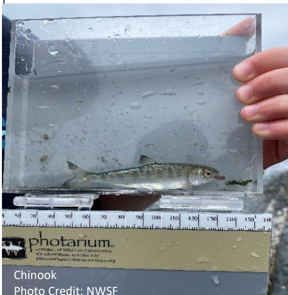
Bowman Bay Beach Seining- July 18

Photos (photos of recent projects or members—include project, photo credit and additional info):