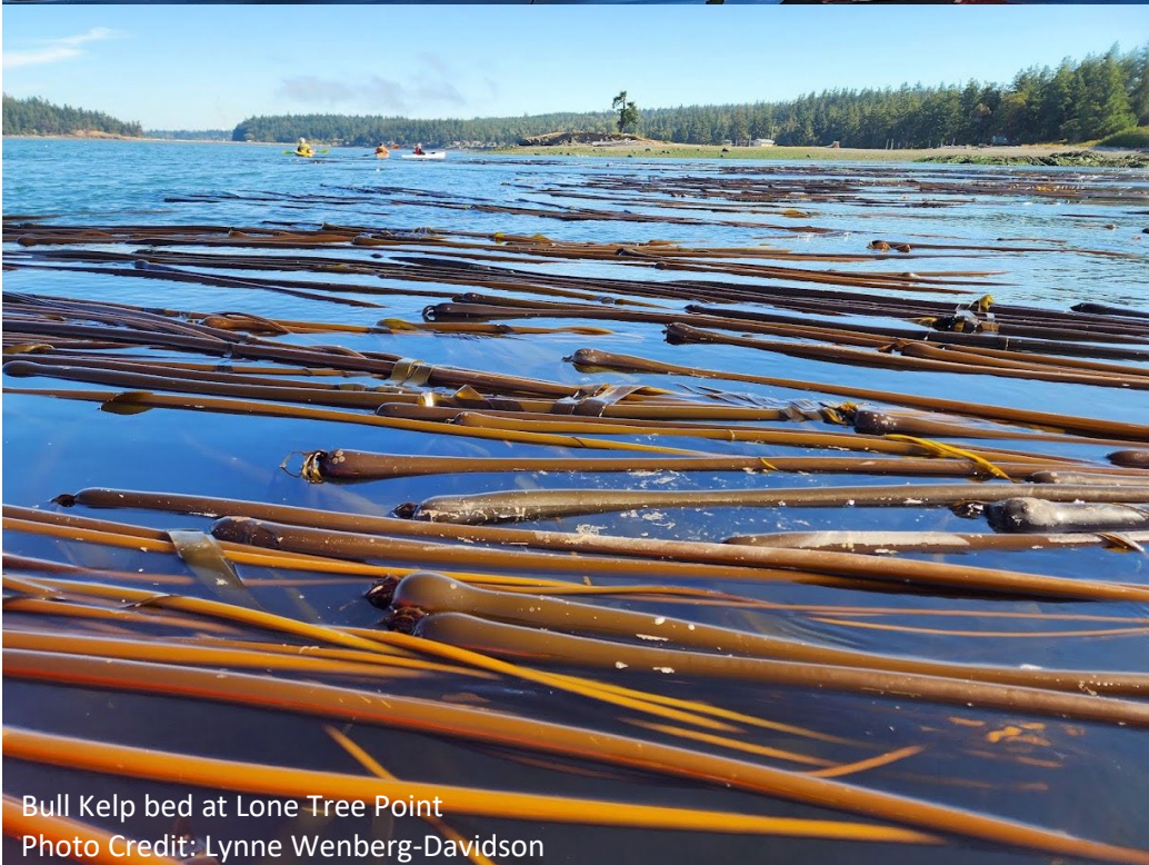
Bull Kelp bed at Lone Tree Point