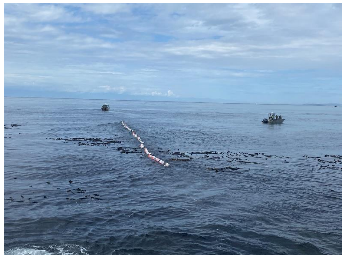
DNR towing away a huge oil spill boom washed ashore on San Juan Island.